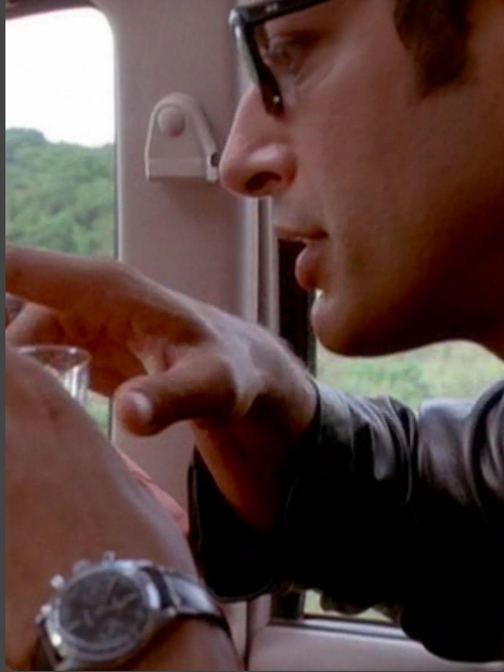
Dr. Ian Malcolm wears a vintage Hanhart watch