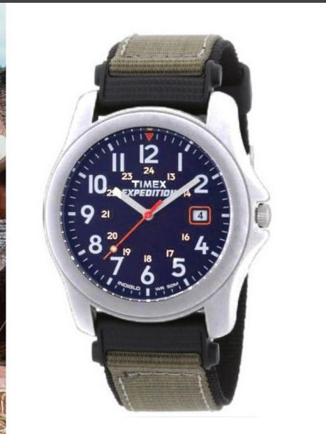
Dr. Ellie Sattler wears a Timex Expedition watch